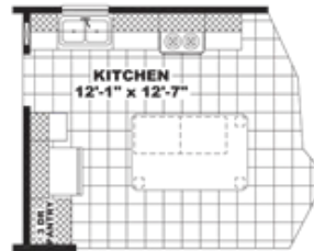
ALTERNATE KITCHEN W/ISLAND

Our home building facilities invest in continuous product and process improvements. Plans, dimensions, features, materials, specifications and availability are subject to change without notice or obligation. Renderings and floor plans are representative likenesses of our homes and may differ from the actual homes. We invite you to tour a Home Center near you and inspect the highest value in quality housing available or call (540) 382-9015 to speak with a Home Consultant. Copyright 2017, CMH. All rights reserved.