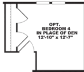
OPT. BEDROOM 4